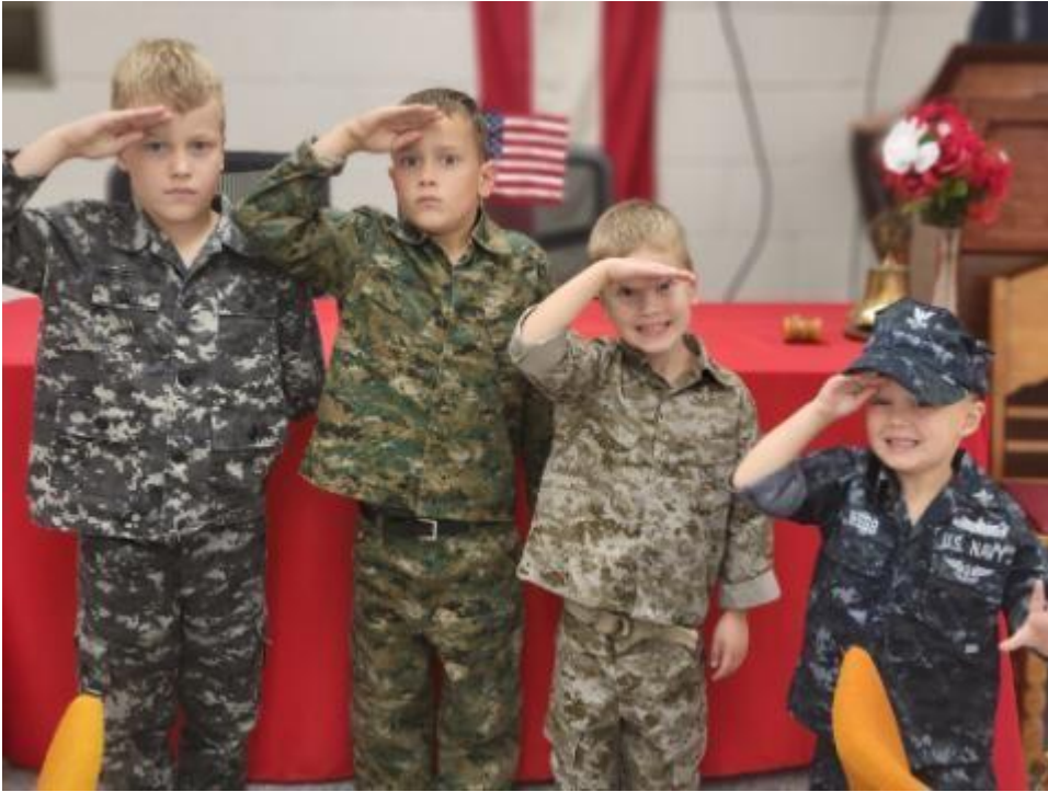
US Navy Birthday celebration at the Post. The new lights installed in the Hall.