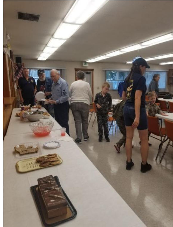
Washington County Veterans Standdown