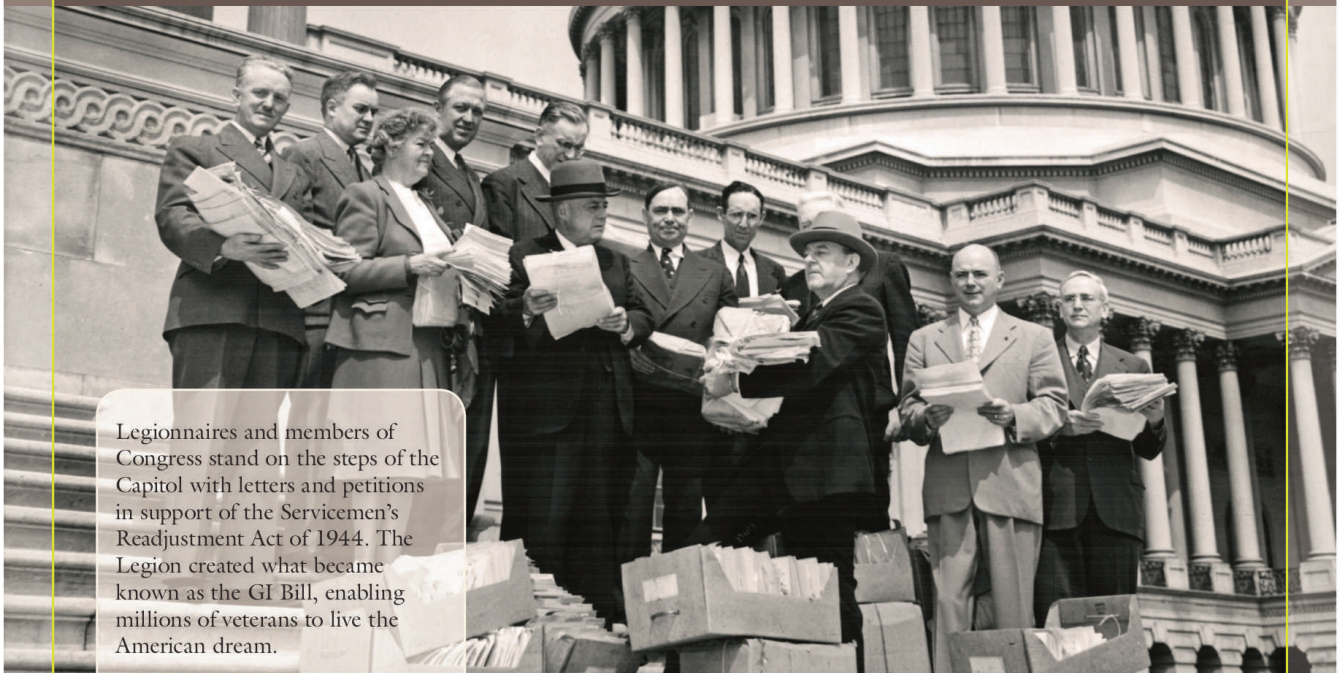
Legionnaires and members of Congress stand on the steps of the Capitol with letters and petitions in support of the Servicemen's Readjustment Act of 1944. The Legion created what became known as the GI Bill, enabling millions of veterans to live the American dream.