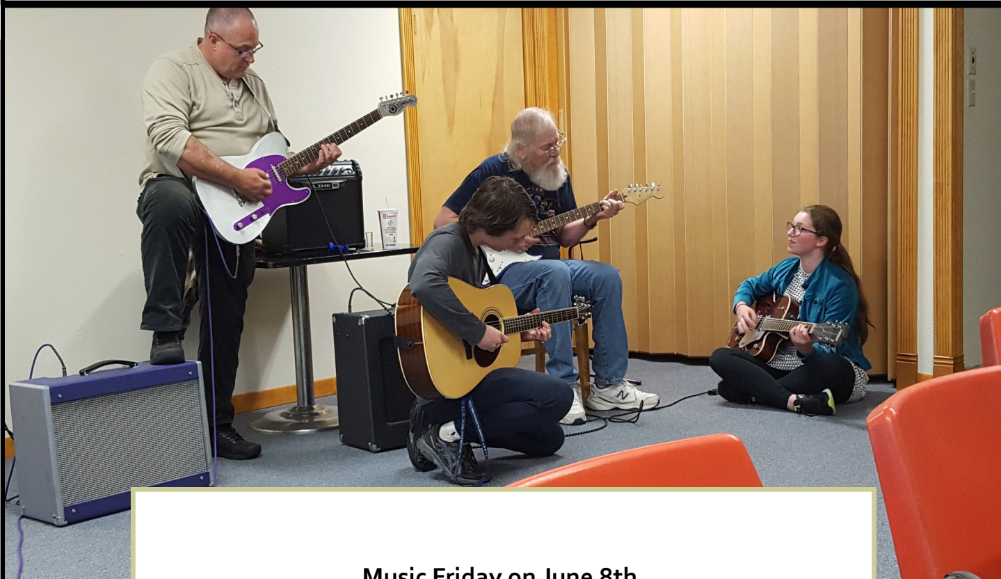
Music Friday on June 8th.