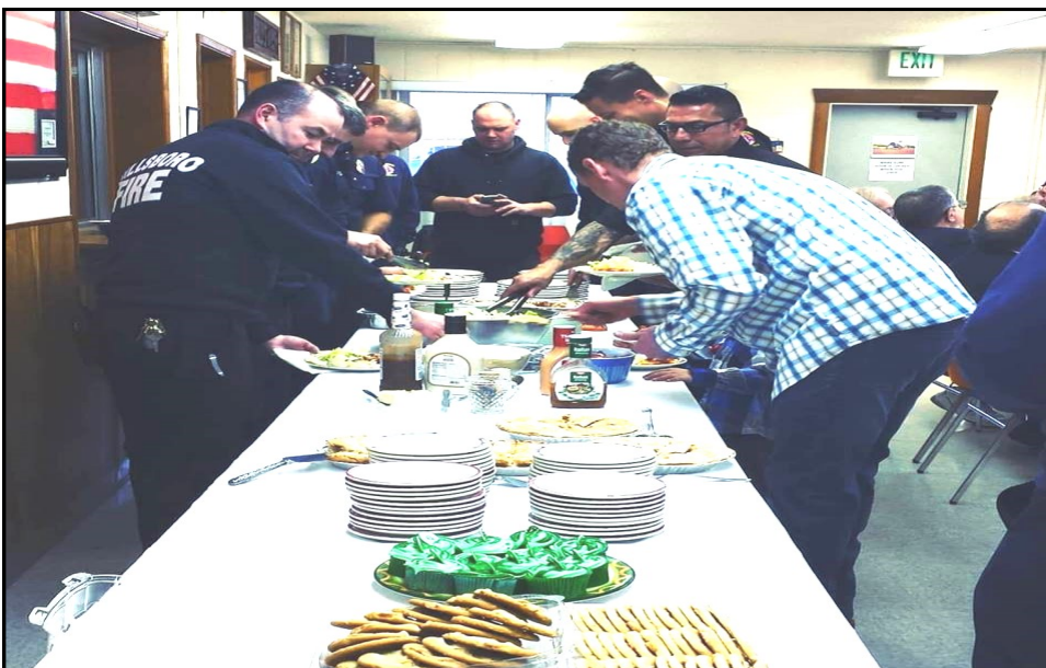
Hillsboro firefighters dig in to their Annual Dinner.